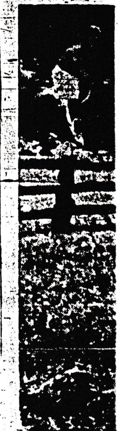
ALMOST A FALL—of the fences in the races near Media. fence in